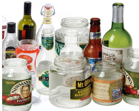
All Glass (any color and size container)