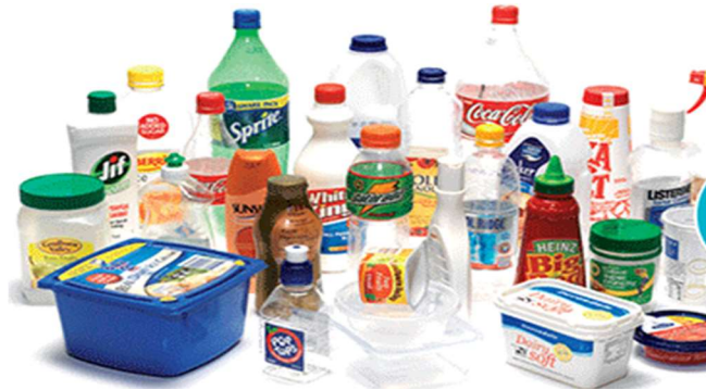
#1&2 Plastic Bottles & Containers (includes clam shells)