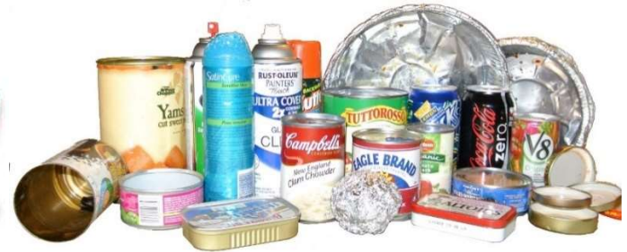
Aluminum, Steel, and Tin Cans & Containers