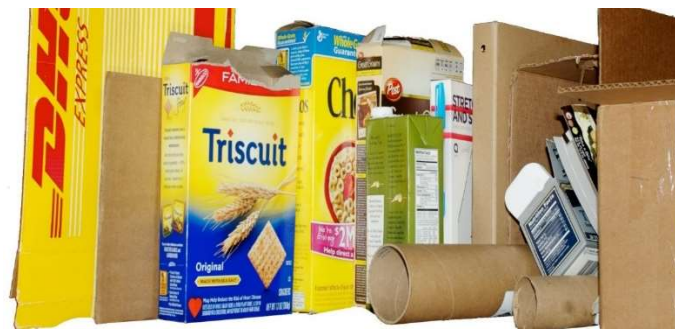
All Waxy and Corrugated Cardboard